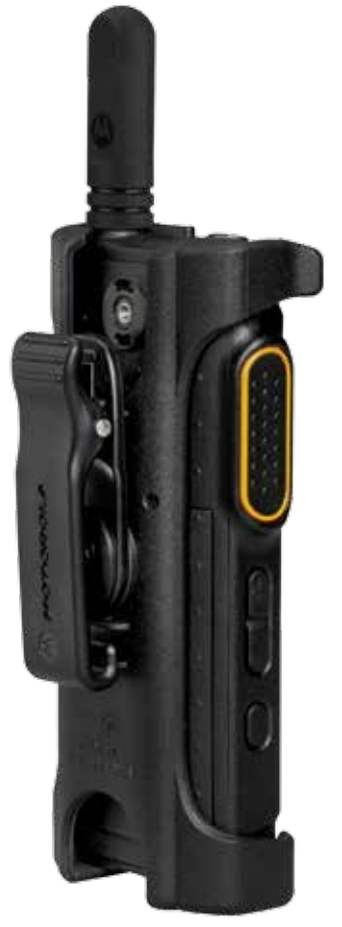
PMLN7190 Carry Holder/Holster with Swivel Belt Clip

By spending countless hours in the field with customers, we've developed accessories that aren't just the most innovative. But also the most useful.