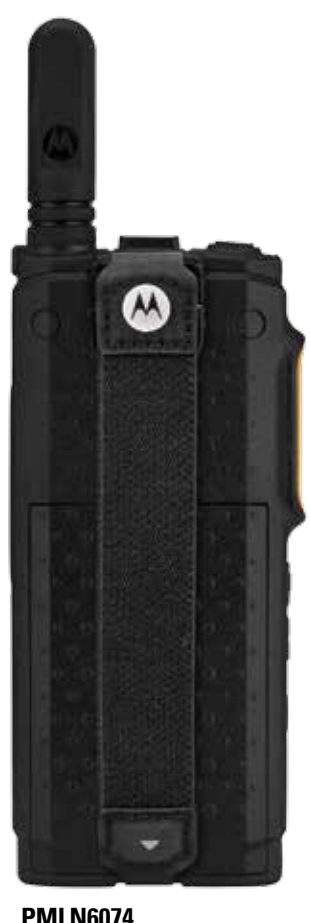
PMLN6074 Nylon Wrist Strap