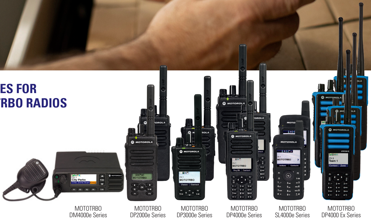
MOTOTRBO DM4000e Series